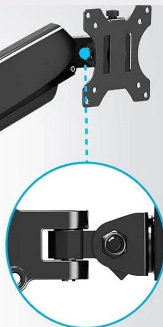
Screen rotatable at will