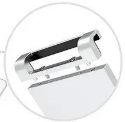
Tablet Enclosure Screw lockable on side