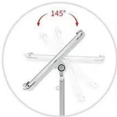
Tablet Enclosure Flips 145° for Perfect Displays to Users