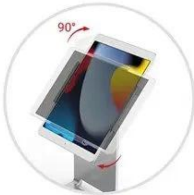
Landscape and Portrait Switching 90° swivel