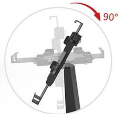
Tilted 90 Degree