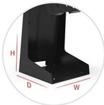
Printer Space W127 x D127 x H127