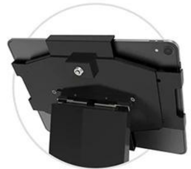
Double Security Protection by screws and key lock