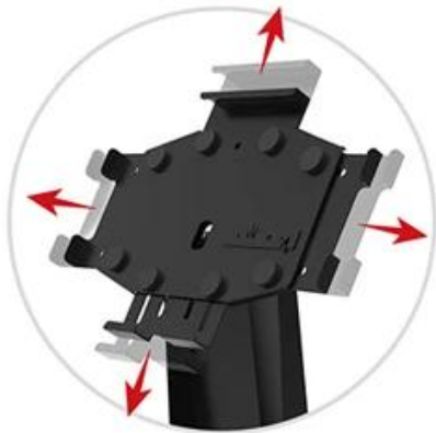
Adjustable Tablet Enclosure compatible with full series of iPad/iPad Air/iPad Pro